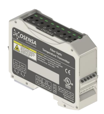
FTX-910-PWR+R Temperature Transmitter